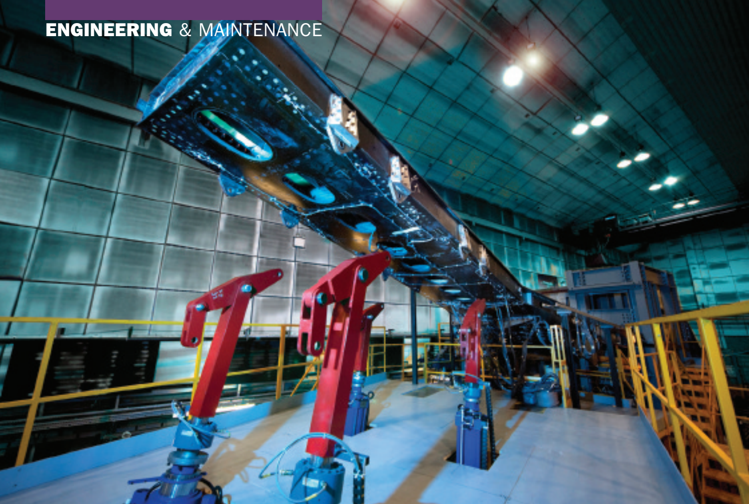
Bombardier's CSeries aircraft, currently in production, will be 40 per cent composite.