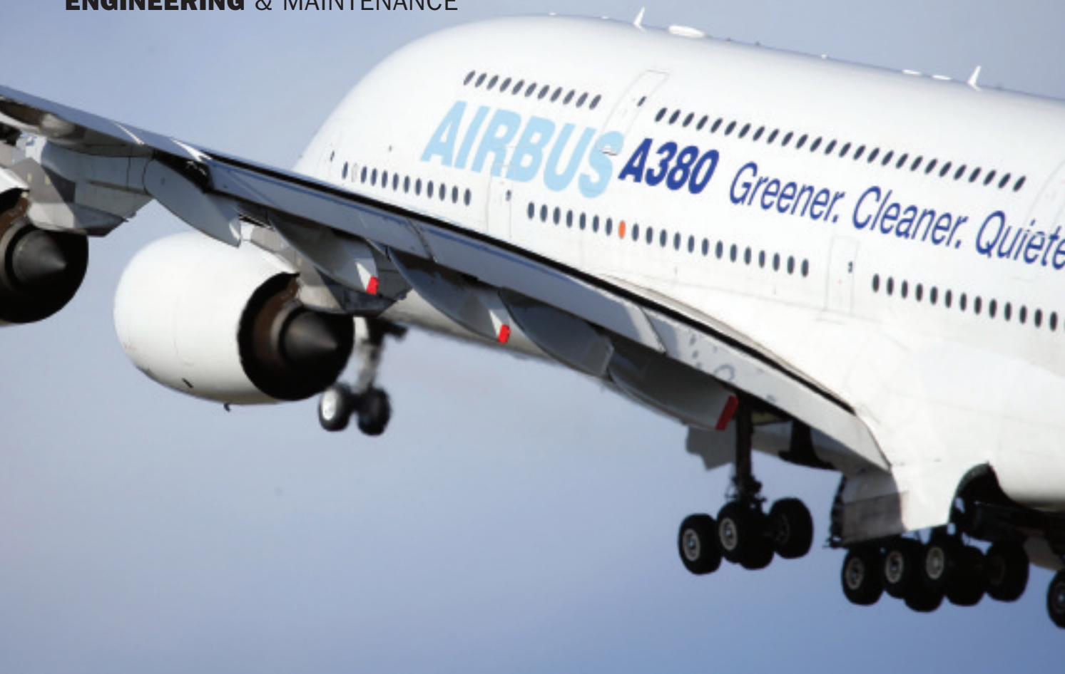
The A380 is 35 per cent composite by weight. Composite materials require special recycling strategies.

slab on impermeable geo-membranes — synthetic liners. Dissection begins with the wings to obviate balance issues, progressing to the tail and finally the front or rear landing gears in order to collapse the airframe. With recertifiable and resaleable parts already removed, the leftover metal is cut up into manageable pieces for transportation to a recycling plant.